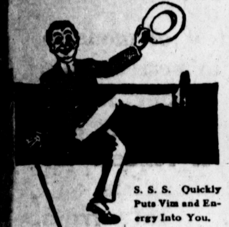
S. S. S. Quickly Puts Vim and Energy Into You.

Gets Right Into Your Blood and Drives Out Every Particle of Poison From Head to Foot.