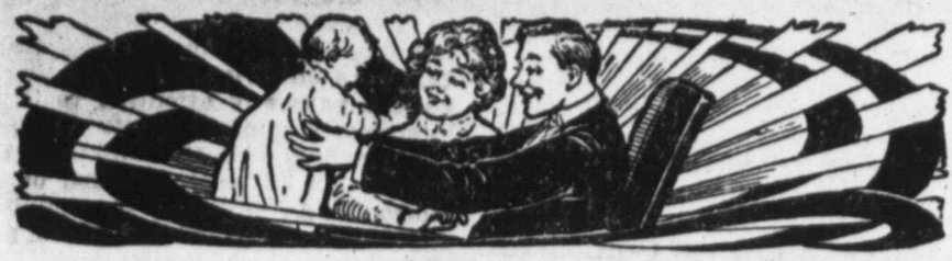
S. S. S. Means Pure Blood Which Insures Long Life and Health.

The Very Latest Theory About How and Why the Blood is Disordered.