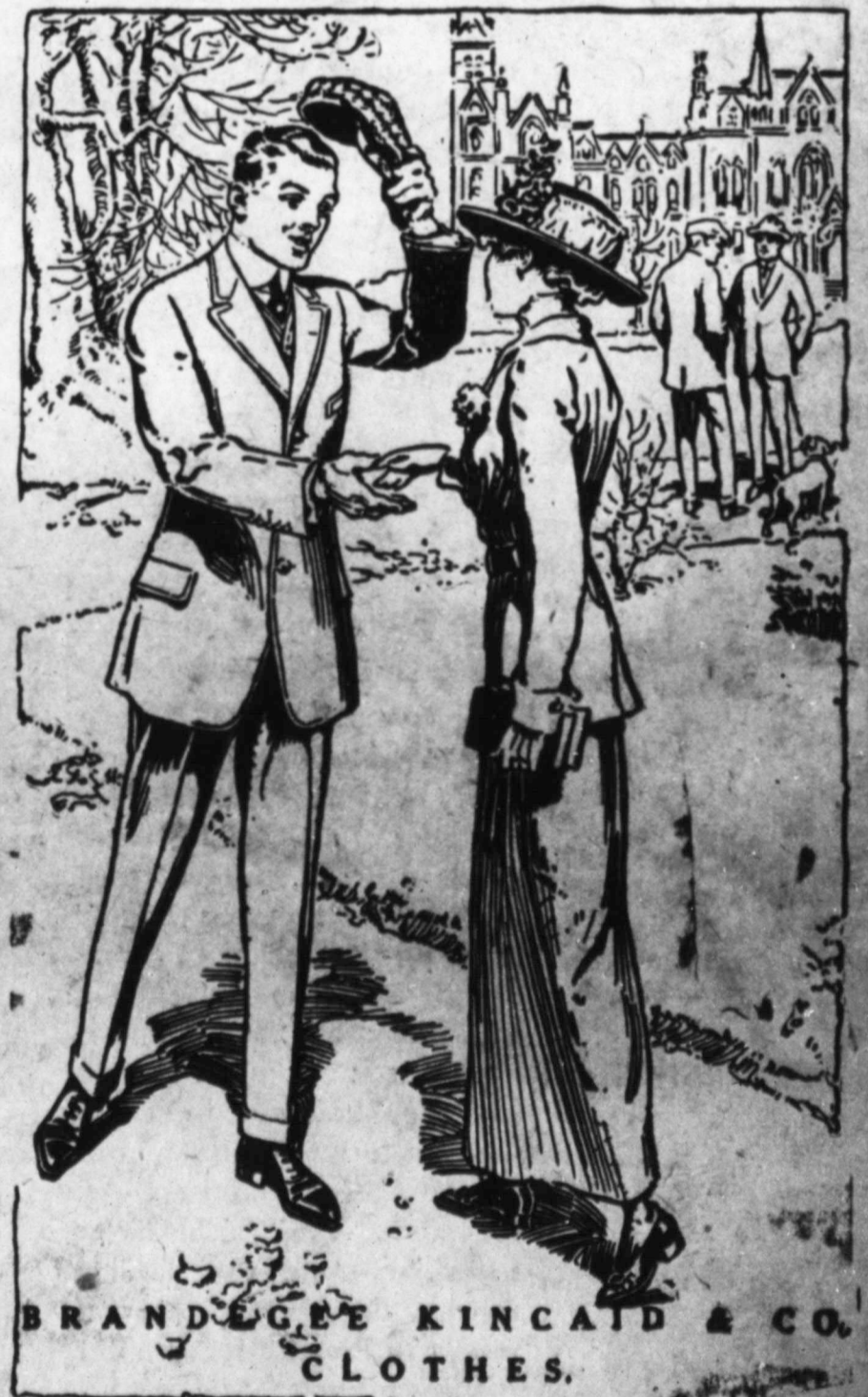
BRANDEGEE KINCAID & CO. CLOTHES.

cannot drag or sag even on a careless dresser. Many a fellow has come to us and told us he "just couldn't seem to get clothes to look like anything on him." We were not slow to show him how clothes could be fitted so perfectly that they would hang and drape admirably. If you think your appearance is not as bright and right as it should be, come to us.