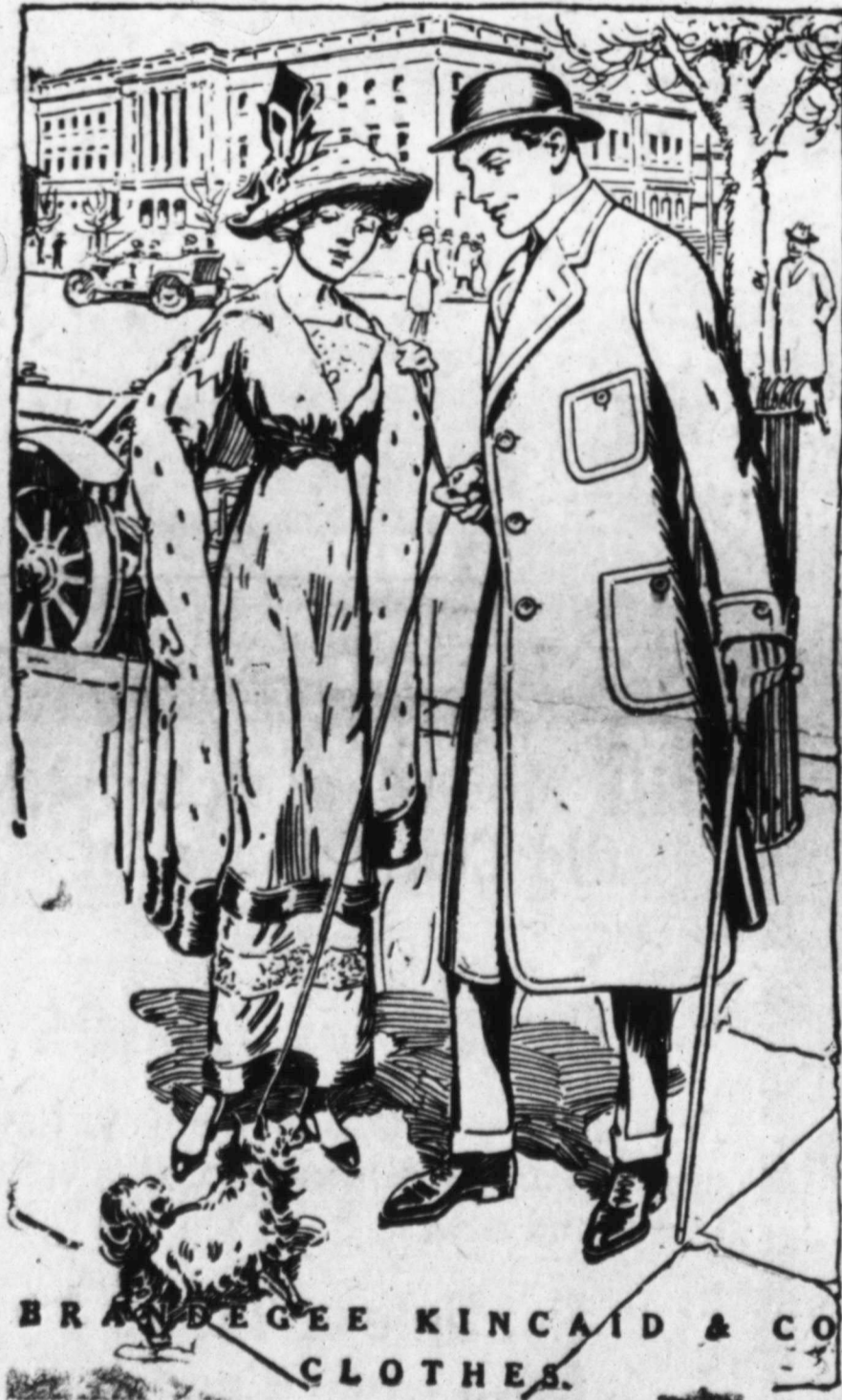
BRANDEGEE KINCAID & CO. CLOTHES.

An ideal husband usually belongs to some other woman.