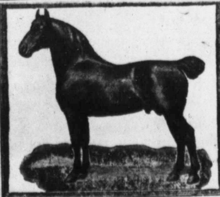
TANHAUSER Register No. 5211

The bill itself provides that it shall not become operative for eight months from the date of its passage nor in its entirety later than fifteen months; but there is a special provision which compels the organization of the Dublin Parliament within a year.