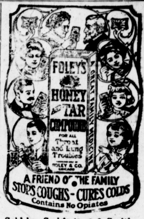
Sold by Swift Bros & Smith

Having settled all sorts of other difficulties, President Wilson will today seek to arbitrate a proposed strike on the railroads west of Chicago. To a man of the high purpose, moral force and determination of the president, almost anything is possible and here's hoping and believing he will succeed.