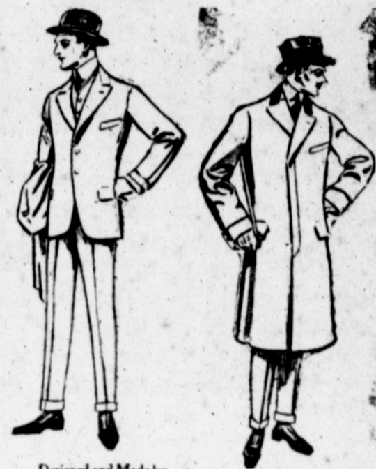
Designed and Made by Sporo-Michael Co., Inc., N. Y.

Sensational Sale Prices Coat Suits, Dresses, Waists, Separate Coats Latest Style Garments