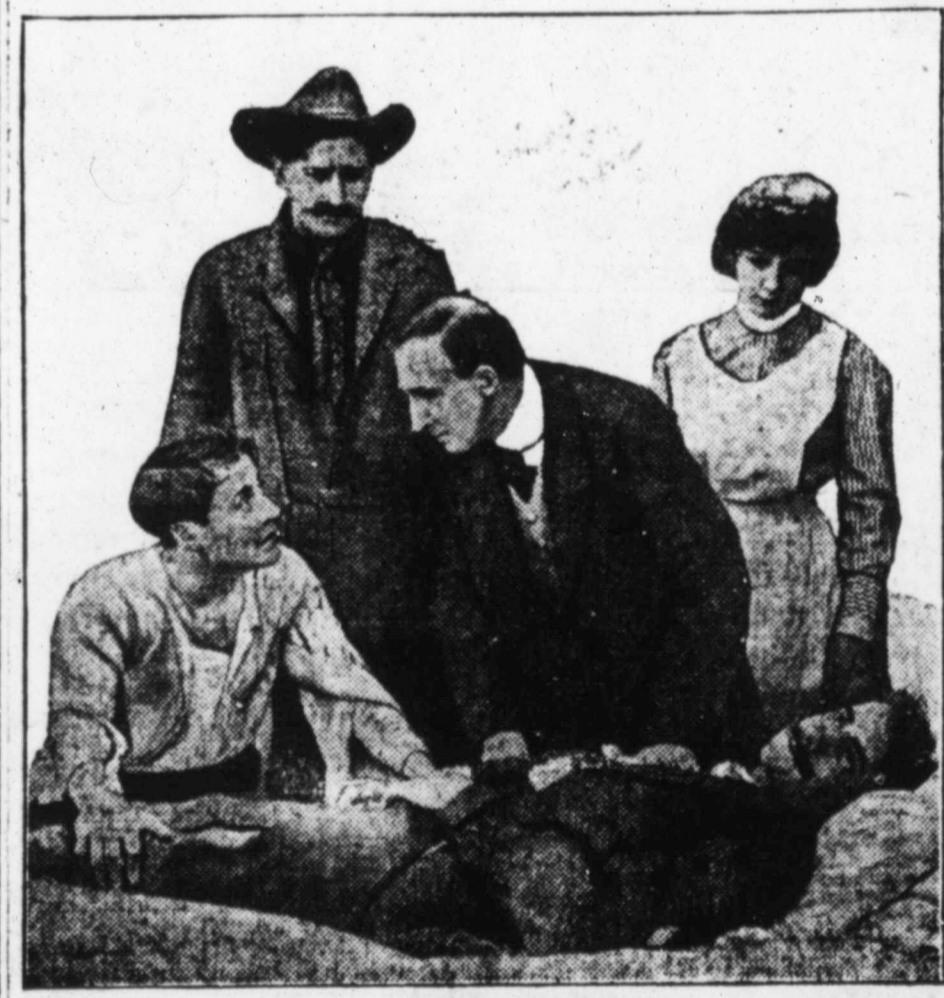
"I Have Saved Him!"

were presented through such widely different mediums, and this novelty relieved the monotony of such a steady grind.