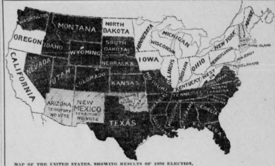
MAP OF THE UNITED STATES, SHOWING RESULTS OF 1896 ELECTION. BRYAN STATES BLACK. MCKINLEY STATES WHITE.

If You Think You Know How It's Going, Cut This Out, Fill It In and Preserve.