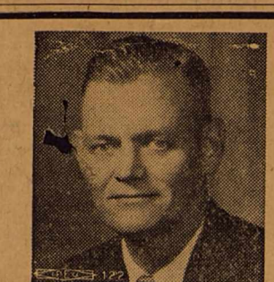
TIME for a Reasonable Man!