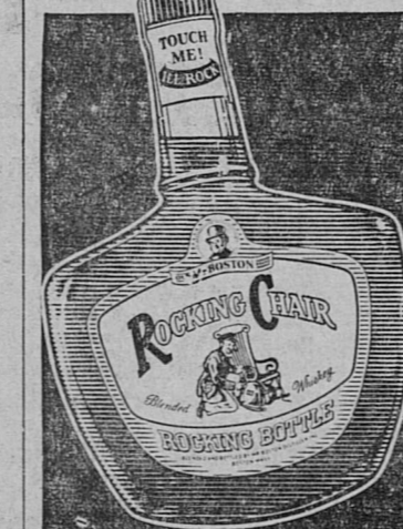
ROCKING CHAIR KENTUCKY WHISKEY A BLEND 80 PROOF, 75% GRAIN NEUTRAL SPIRITS. MR. BOSTON DISTILLER INC., BOSTON, MASS.

Be the first on your block with the bottle that rocks