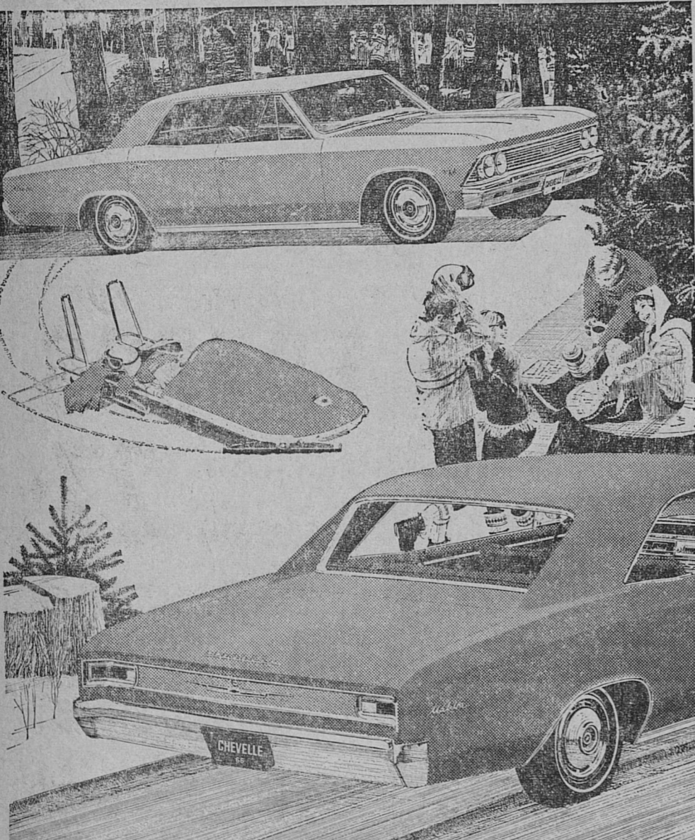
'66 Chevelle Malibu Sport Coupe (foreground) and new 4-door Malibu Sport Sedan.