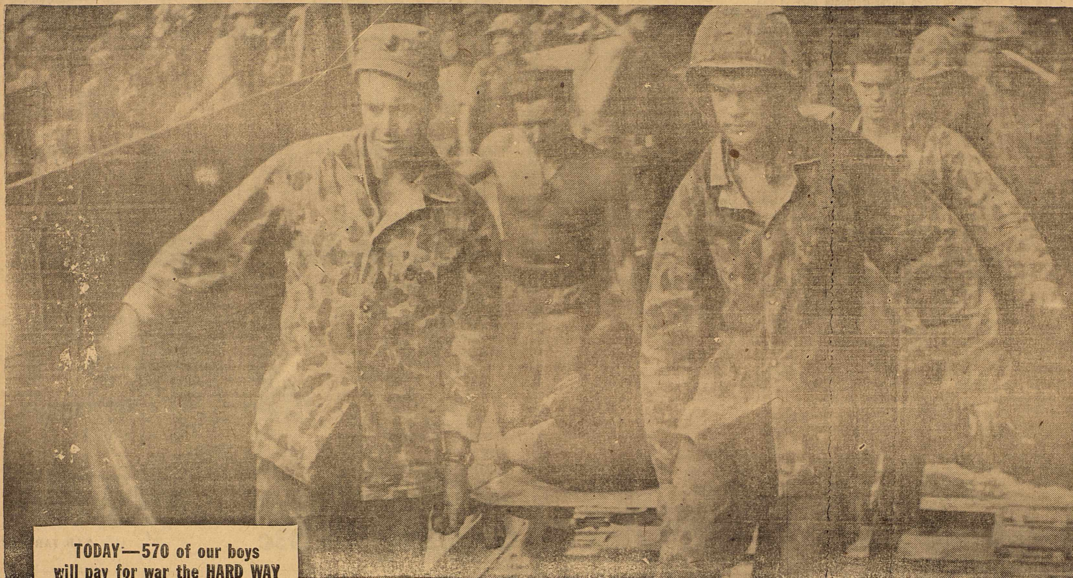
TODAY—570 of our boys will pay for war the HARD WAY