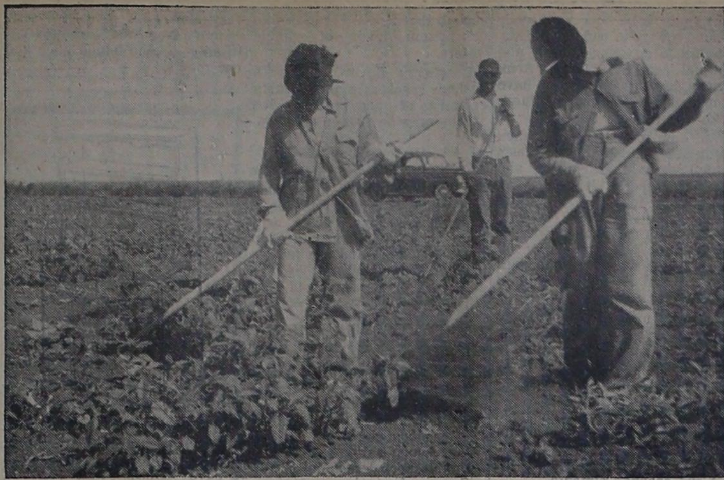
It's that time again, and these hoe hands are hard at work in the Oklahoma Lane area this week removing weeds from around tender young cotton plants. Spring rains prompted a heavier weed crop than is usual this year.

dom and frustrations, as well as such physical factors as overwork and strain, will cause that tired feeling.