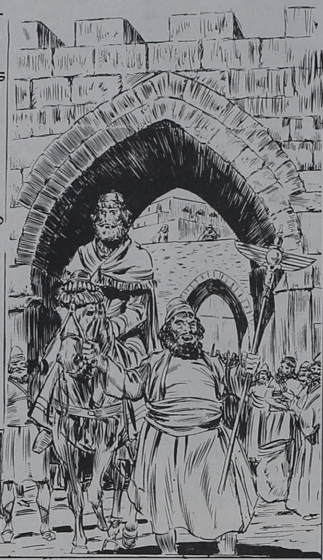
187 SAVE THIS FOR YOUR SUNDAY SCHOOL SCRAPBOOK

AND HOW THE YOUNG HEARTS OF BIBLICAL YOUTH MUST HAVE SWELLED ON HEARING THE STORY OF THE MUCH MALIGNED MORDECAI WHO BY THE KING'S ORDER WAS LED THROUGH THE STREETS ON THE KING'S OWN HORSE AS AN ACT OF HONOR BY THE VILLAINOUS HAMAN WHO HAD TO PUBLICLY PROCLAIM THROUGHOUT THE CITY'S STREETS THE FACT THAT HIS BITTER ENEMY HAD FOUND FAVOR WITH THE KING! (ESTHER 6)