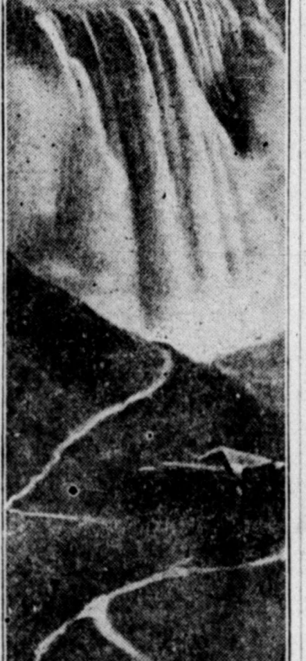
View of Niagara Falls.

A short distance below the falls an iron bridge leaps the gulf from Amerlong day's work. Like our Indians cent in operating expenses. This ica to Canada. For myself, I happen to think the bridge an object exhibiting real beauty, in its curve and in its pattern; but apart from such personal prejudices, no one can deny that the falls, weaving a tremendous gauze of vapor athwart the rigid spimore than $600,000 in freight earn- der's web of metal, do indeed beautify ings and about $225,000 in passenger | it and throw round its arch a glamour