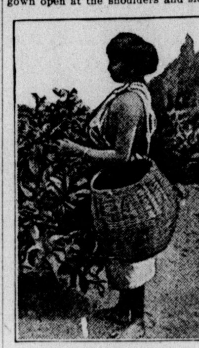
Work for Small Wage.

London.-The accompanying illutration represents the type of tea pickers found on the big plantations of Ceylon. During the tea picking season on these plantations large numbers of Ceylonese, women and girls, are employed to gather the crop. They become very rapid and expert in this kind of work, while their wages are very low as compared to American standards, yet are amply sufficient to meet their wants. A loose cotton gown open at the shoulders and sides