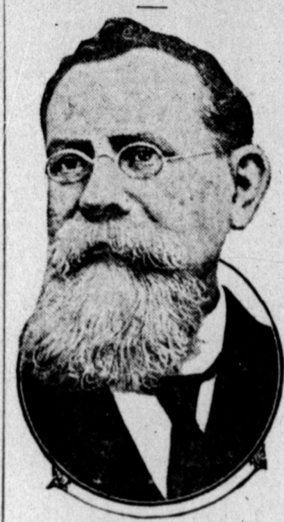
A Small Skirmish.

Vera Cruz, Mex .- What had promsed to be the first fight between the are expressed by those in a position to "By virtue of the above 1 state to United States army and the Mexican know the real situation as to the posyou that I can not accept the armistice troops Saturday ended with the ex-sibilities of a successful solution of change of not more than half a dozen the Mexican problem by the media-"Consider my act solely as one who shots. The Mexicans threatened to tors of the A. B. C. powers, and they is acting with the determination of "attack immediately unless the Amer- declare unequivocally that it will be doing only what he considers best for icans surrendered their position at impossible to restore peace by diplothe interests of his native country." the water works at El Tejar within matic means that nothing less than General Carranza shortly after his ten minutes," but failed to fulfill their power, backed by an army, can force