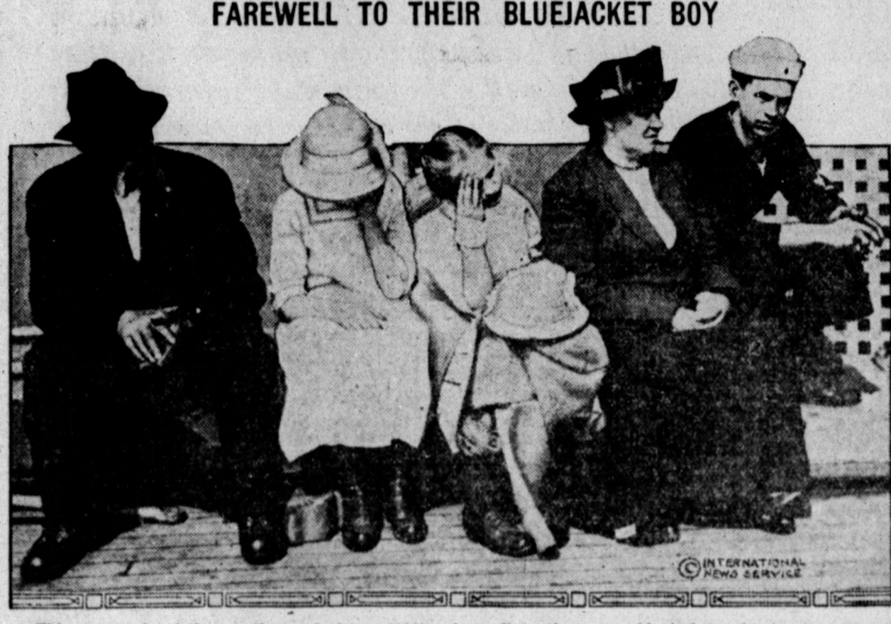
This scene, of a father, mother and sisters bidding farewell to the young bluelacket, who is about to sail away for service against the Mexicans, is being repeated over and over these days at every navy yard.