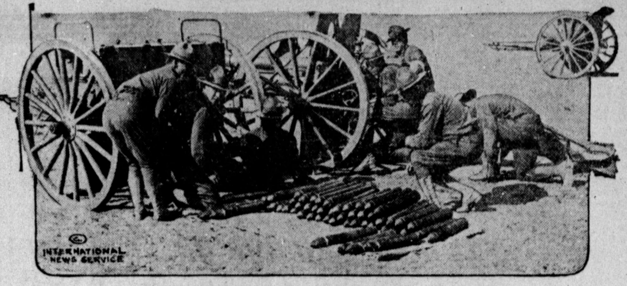
Regular army gunners from the forces now in Texas, loading one of their efficient fieldpieces.