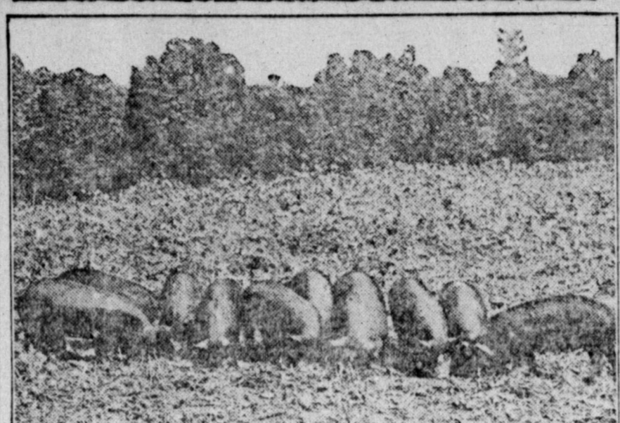
Pigs at Weaning Time on Gowpeas.