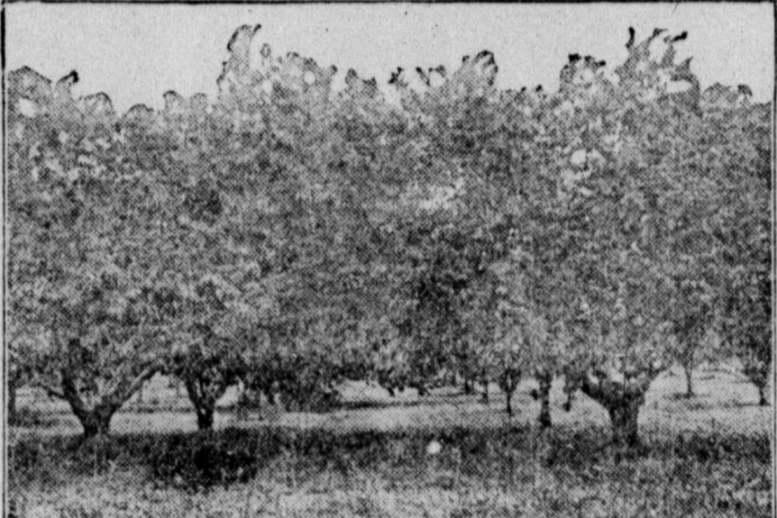
Elberta Peach Trees Pruned to Produce Open, Spreading Tops.