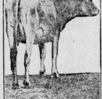
A Young Jersey.

part of wisdom to punish her for kicking.