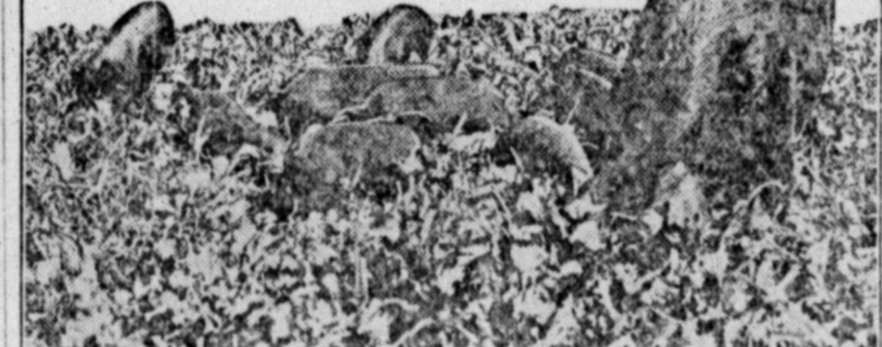
Sow and Litter of Pigs on Rape.