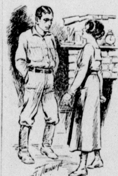
thing In It."

springtime with you only means get- over four thousand miles to have a ting back to work. You want to get good time, and then running away throughout Texas last Friday. back into the muddled rush of peopled from it. It was very foolish of me, I places, do you? You want to be where think now. Well, the longer we live ou can associate with fluffy-ruffle, the more we learn. Day after tomor- ised to plant war gardens in Harris pompadoured girls, and be properly in- row you'll be in Bella Coola. The cantroduced to equally proper young men. nery steamships carry passengers on Lord, but I seem to have made a mis- a fairly regular schedule to Vancoutake! And, by the same token, I'll ver. How does that suit you?" probably pay for it-in a way you wouldn't understand if you lived a had vanished from the panes. They thousand years. Well, set your mind regret at leaving all this? were wet to the touch of her fingers. at rest. I'll take you out. Ye gods and She unhooked the fastening, and swung little fishes, but I have sure been a point of view," she returned. "The