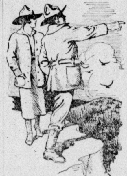
"That's Bella Coola Over There," He that an average of only 8 per cent of

The evening of the third day from camp was made and the fire started, tion to be held in the town of Bastrop