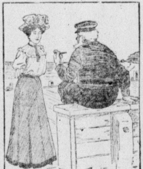
"But, Mr. Mainbrace, why do they you'd ever tried to steer one."