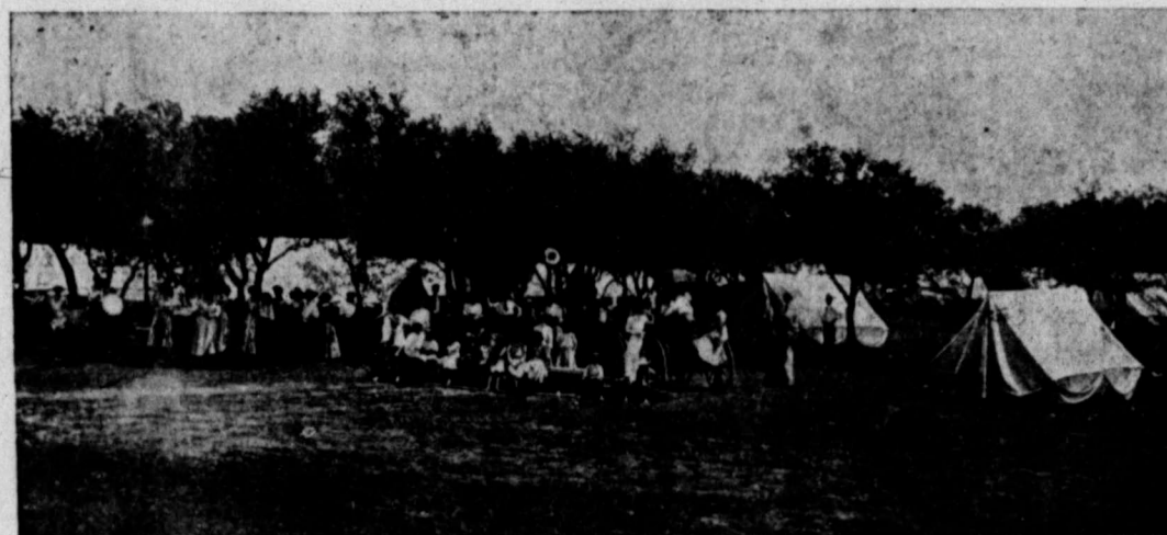
THE WHITE CITY AT THIS YEAR'S WESTMINSTER PRESBYTERIAN ENCAMPMENT

Thus another old citizen has passed over the River. A man of strong character and unusual talent, whom ill health had prevented from reaping the benefits of early preparation. A good citizen, a loyal friend and a loving parent and husband. In his death the community sustains a loss, and his family an irreparable bereavement. Peace to his ashes.