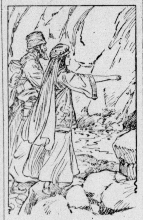
"That is the Passage."

The girl took from her head the large cotton cloth with which she veiled herself, and folded it and laid it down on the rock by the pool; then she let her outer tunic of thin white woolen fall to the ground round her feet and stepped out of it, and folded it also, and laid it beside her veil, and she stood up tall and straight as a young Egyptian goddess in the starlight, clothed only in the plain shirt without sleeves which the women of