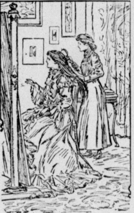
"Potts," She Said Suddenly, and Then Stopped.

"Really! How nice! Have you a voice, too? Do you sing at all?" "Oh, no, ma'am!" answered Potts in a deprecating tone. "One in the family is quite enough!" Margaret vaguely wondered why, but did not inquire. "You are quite sure that it was your brother who was speaking, I suppose," she said. "Oh, yes, ma'am! I looked down over the banisters, and there he was!" Margaret had the solid health of a great singer, and it would have been a serious trouble indeed that could have interfered with her unbroken and dreamless sleep during at least eight hours; but when she closed her eyes that night she was quite sure that she could not have slept at all but for Potts' comforting little story about the brother with the "counter-tenor" voice. Yet even so, at the moment before waking in the morning, she dreamt that she was at the telephone again, and that words in a strange language came to her along