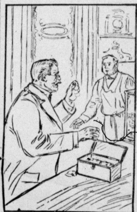
"Merciful Providence!" Cried Pinney.

They stayed a long time, and Spiro asked many questions for Baraka, chiefly relating to the sliding scale of prices which is regulated by the