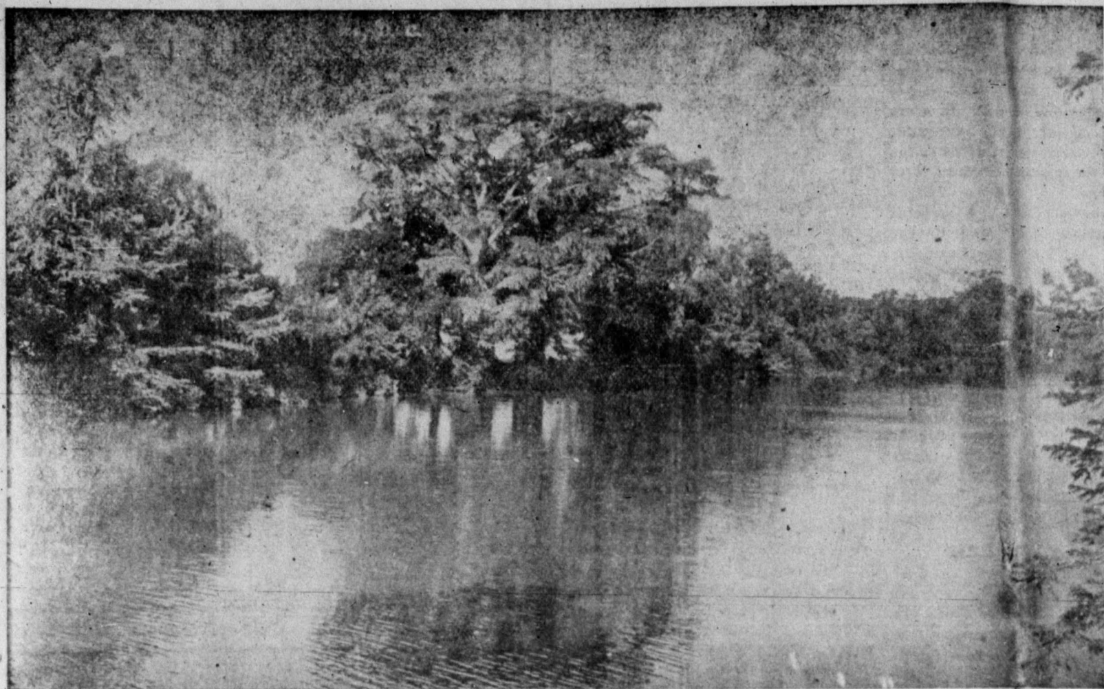
THE SUNRISE PAINTING PICTURE IN THE MIRROR OF THE STREAM, NATURE SMILING AT HERSELF

Draws hundreds to the Hill Country. The big Presbyterian Camp is a scene of bustling life and activity. A great crowd of pleasure seekers throngs the Camp Grounds and the city.