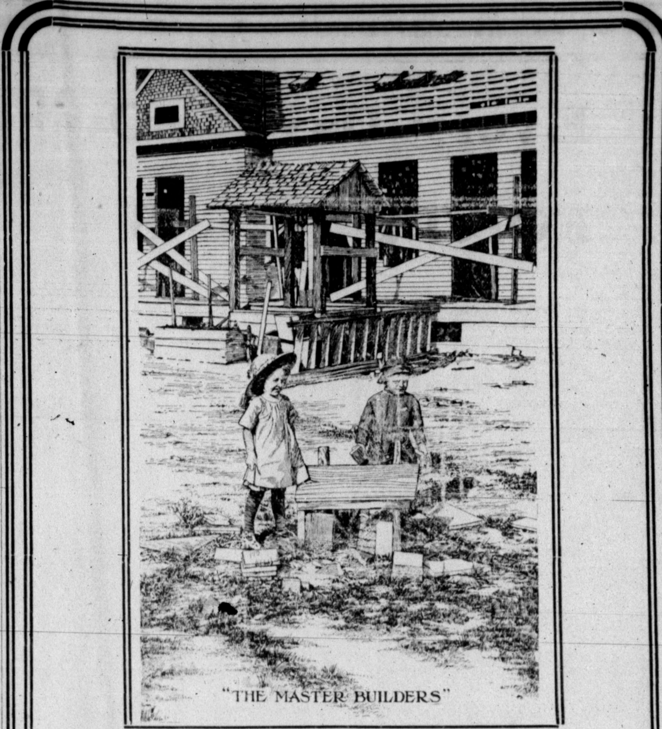
"THE MASTER BUILDERS"

GEORGETOWN, Tex., July 29.—Williamson county voters balloted today on whether the county should be prohibition or anti. Practically the entire county, except Taylor and Granger is already dry. The campaign has been one of the most notable in the country in recent years. About 1000 automobiles have been in use by the campaigners for several days. Both pros and antis are claiming victory on the strength of early voting. There are 7500 qualified voters in the county and a heavy vote appeared to be turning out.