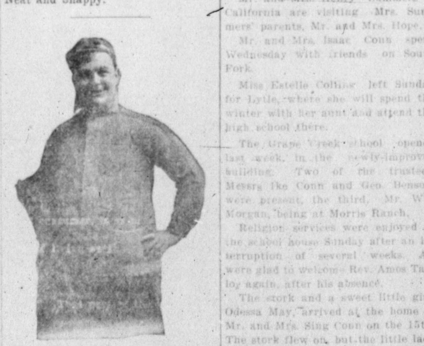
Men wear them and they are comcritical and dressy.