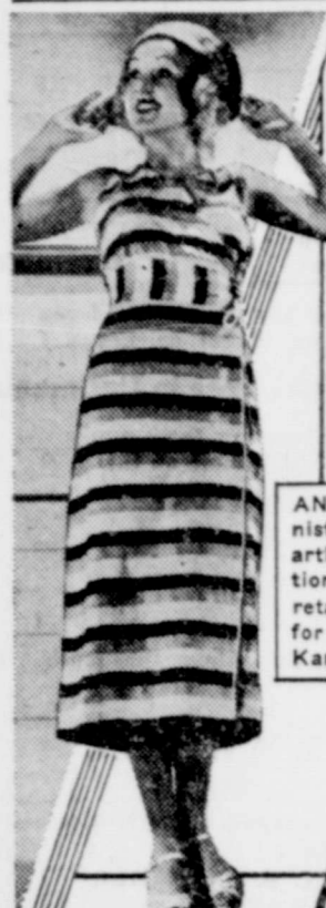
NEW BEACH FASHION—worn at Santa Monica by Betty Grable, picture favorite. The frock is made of blazer-striped linen in brown, orange and white, cut in a wrap-around style. It laces at the waist line with a white cord.