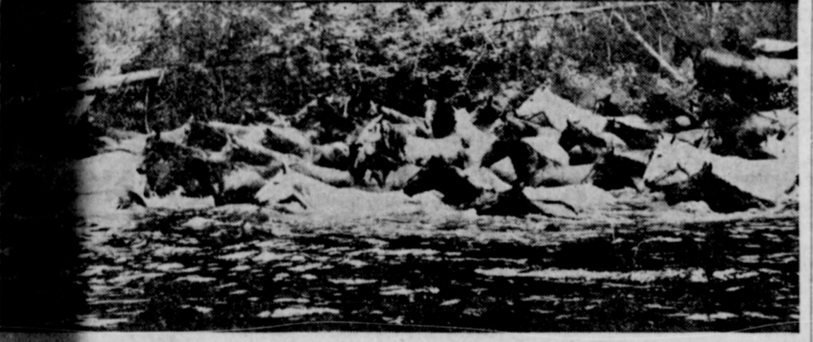
Distressed broncos, 92 head of them from the Steems mountains, were herded to Molalla, Oregon, for exhibition during the annual "Buckaroo." The wild horses ended their 42-day trek by swimming the Molalla river.

Will Head Television Arch Extensive New Experiments