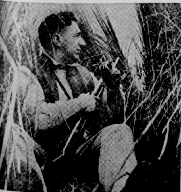
Armed with a big gun and a miniature camera, this duck hunter has taken a snapping nimbrod for some of the winged targets to come along. The bird was taken on Tawas lake, far-flung preserve in the northern part of Michigan's lower peninsula.