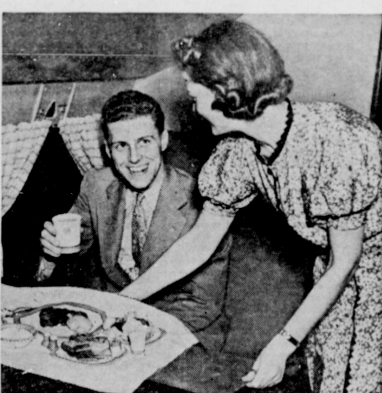
Serving a hot meal to a passenger in the clouds is no simple trick. The student shown above is practicing the deft art and doing very well.