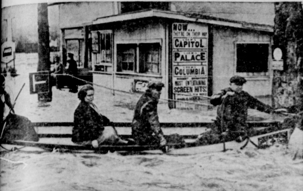
Victims of raging Potomac river flood waters are evacuated from their inundated homes by a rescue boat. More than 1,000 homeless persons waited for their boats to subside before returning to their homes.