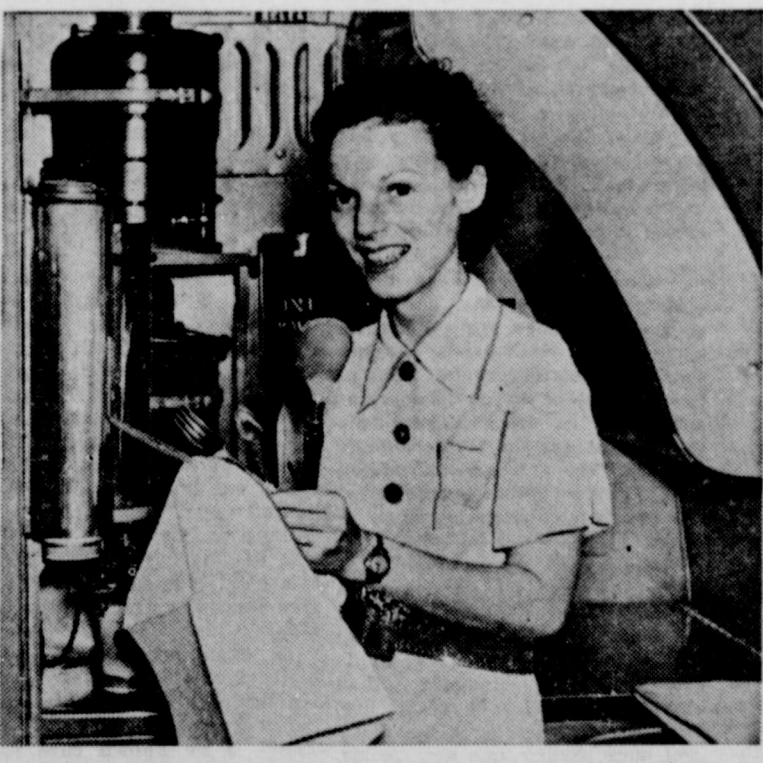
Paper dishes are usually used for meals in the sky, but the silverware must be polished (as shown above) in the liner's compact buffet.