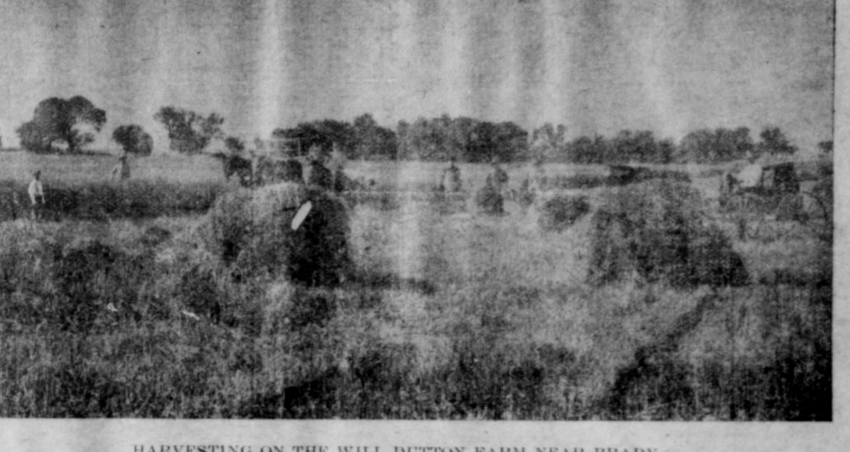
HARVESTING ON THE WILL DUTTON FARM NEAR BRADY

White girl for general de avenues and the beauti- housework in family of as mesquites which offer four. Good position for right party, room in What is more beautiful dwelling. Apply at Mel fur to the eye than the ton home, Brady, Texas