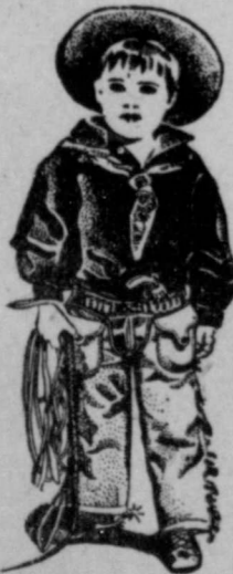
The Texatone Boy