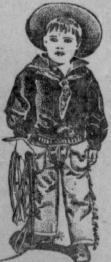
The Texatone Boy