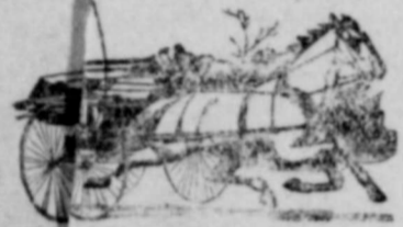
It's Cheaper to Walk Than to Ride.

For Teams and Swell Rigs at Reasonable Rates. None Can Compare with Dyson & Co. Phone No. 40