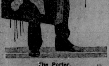
The Porter. Its heft was light. He sighed: "I hope so." (To be continued.)