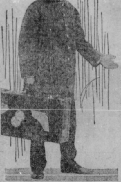
The Porter. Its heft was light. He sighed: "I hope so." (To be continued.)