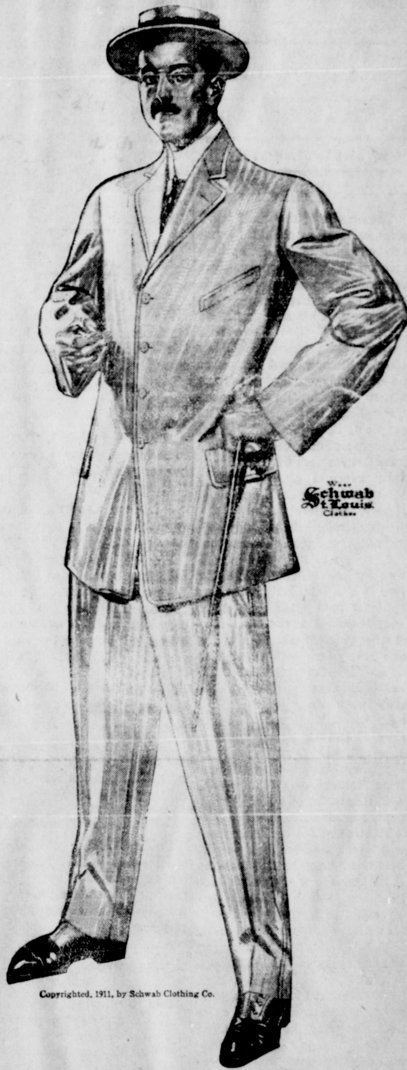
Copyrighted, 1911, by Schwab Clothing Co.