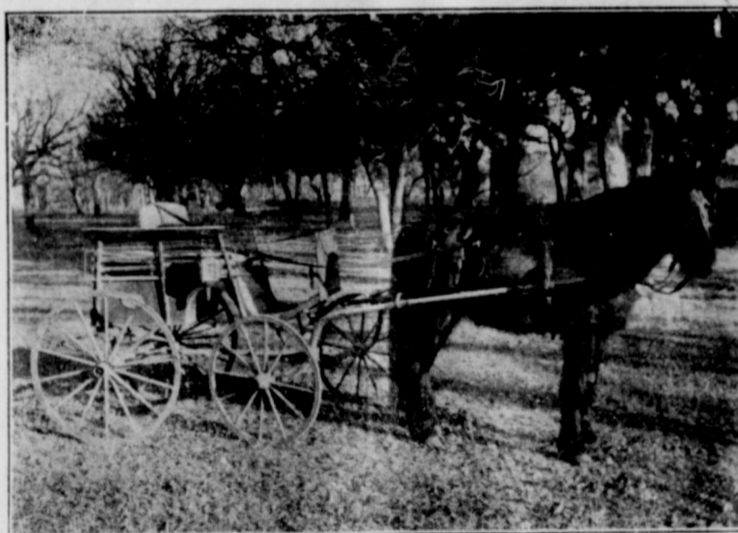
"RUFUS" THE GRAND PRIZE

Rufus is a handsome Shetland pony, clean built in every particular, with beautiful full mane and foretop, and a tail that sweeps the ground. He is as playful as a kitten, will eat anything from sugar to scraps from the table, and is, in fact, as much of a pet as a lap dog.