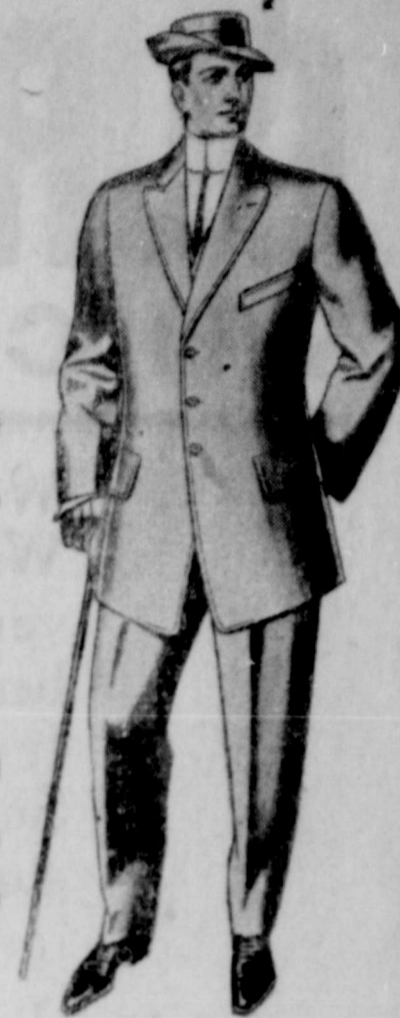
DESIGNED BY SPERO, MICHAEL & SON NEW YORK

Our entire stock of Men's Clothing will be placed on sale at fifty cents on the dollar.