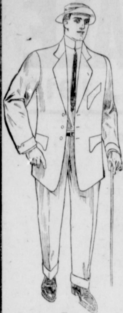
DESIGNED BY SPERO, MICHAEL & SON NEW YORK

FOR THE NEXT TEN DAYS BEGINNING SATURDAY, NOV. 9TH