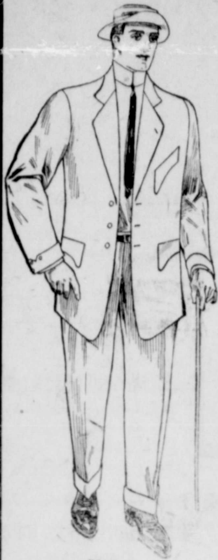
DESIGNED BY SPERO, MICHAEL & SON NEW YORK

FOR THE NEXT TEN DAYS BEGINNING SATURDAY, NOV. 9TH