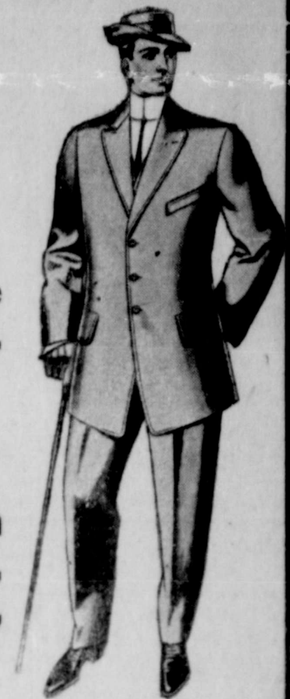
DESIGNED BY SPERO, MICHAEL & SON NEW YORK

Our entire stock of Men's Clothing will be placed on sale at fifty cents on the dollar.