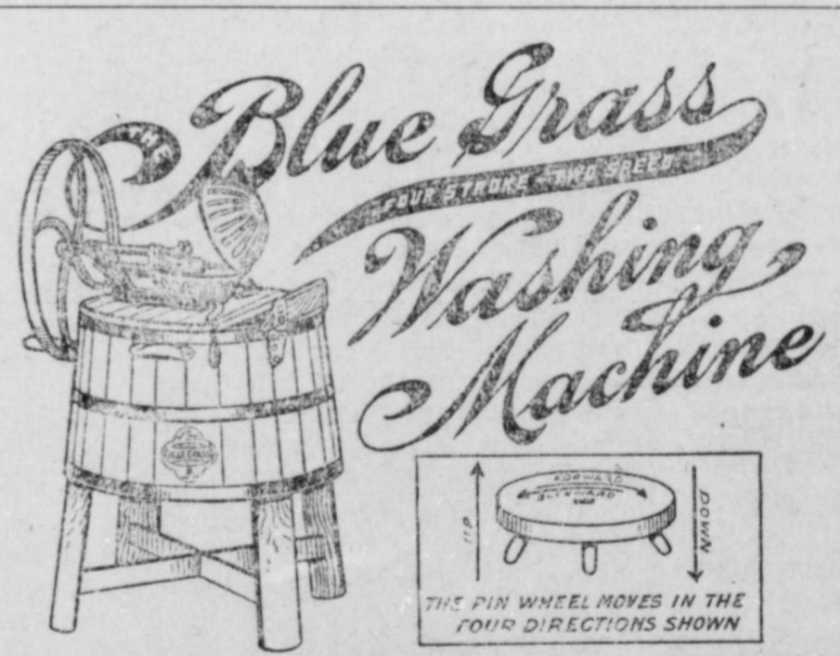
THE PIN WHEEL MOVES IN THE FOUR DIRECTIONS SHOWN

Our stock of Shelf Hardware is complete. We are agents for the Mitcheli Wagon and Sharples Cream Separators. We have only the best and stand behind every article we sell.