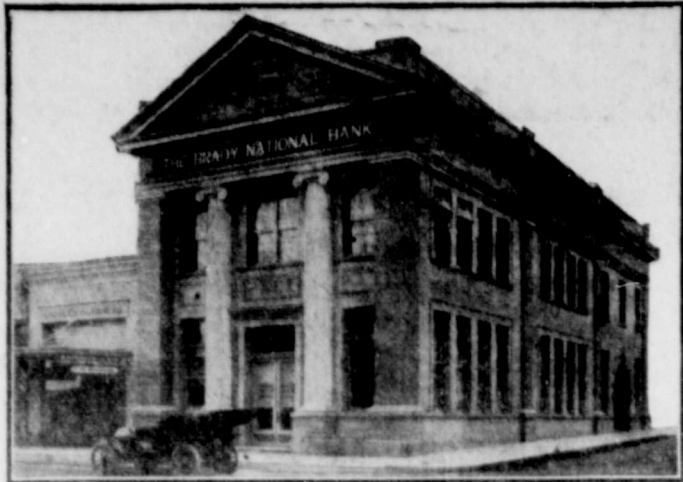
Make OUR Bank YOUR Bank