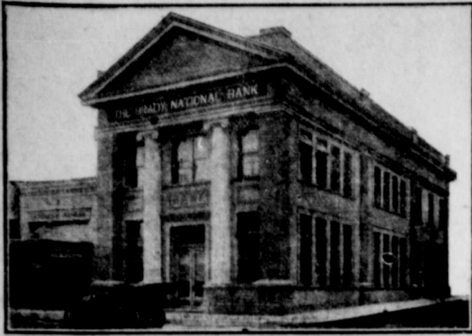
Make OUR Bank YOUR Bank