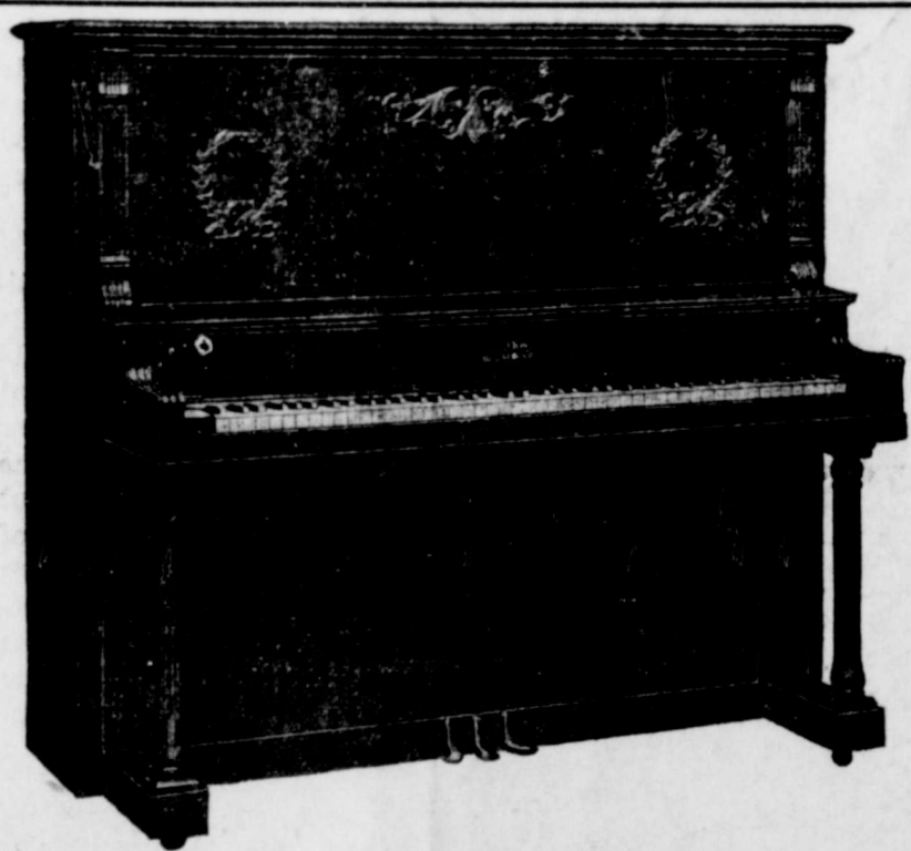
The Elegant $400.00 Claxton Upright Grand Piano. Guaranteed for Ten Years. NOW ON EXHIBITION AT JONES DRUG STORE

Names of Contestants will not be known, but each Contestant will be given a number instead. Every Contestant gets 2000 Votes to start with. Votes once deposited in ballot box cannot be transferred to another. Votes should be tied securely in packages with Contestant's number and amount on top slip. Count will be made every Wednesday afternoon—date of first count to be announced later.