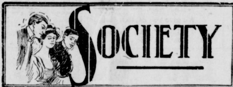
Ring 163 If You Have Items for These Columns.

A Cascaret tonight will surely straighten you out by morning. They work while you sleep—a 10-cent box from your druggist means your head clear, stomach sweet and your liver and bowels regular for months.