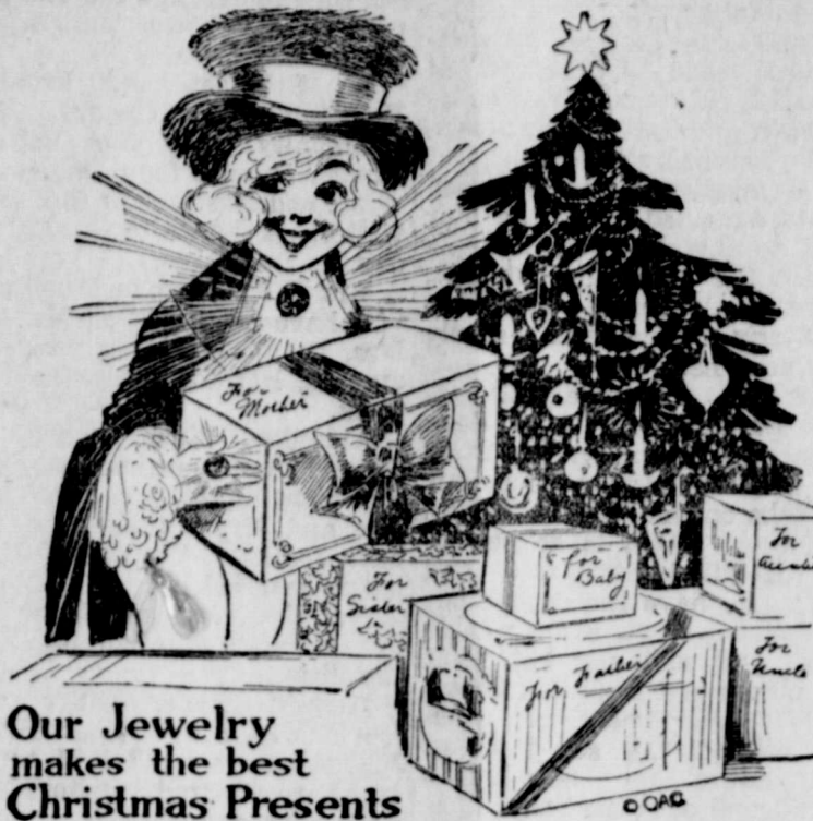
Our Jewelry makes the best Christmas Presents