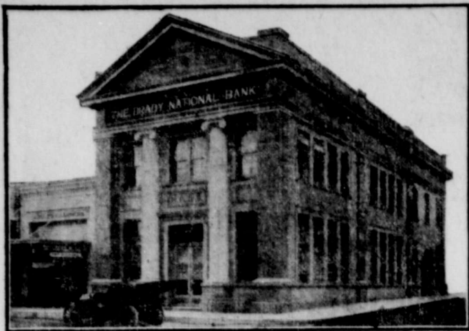
Make OUR Bank YOUR Bank