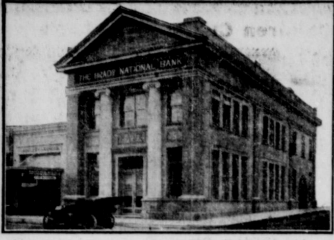
Make OUR Bank YOUR Bank