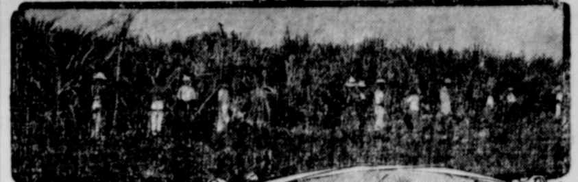
GATHERING SUGAR CANE

We are so used to sugar that we are likely to forget to give it its properly important place. Right now if somebody asked you what sugar was good for you'd probably say—"Oh! to put in coffee and tea and for making candies and desserts." That's it—we all think of sugar as a sweetener and overlook its value as a food.