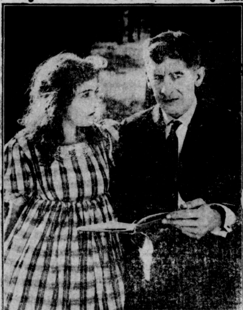
DOROTHY GISH AND FRANK CAMPEAU IN "JORDAN IS A HARD ROAD" Also "Fatty and the Broadway Stars"--Keystone Comedy -2 Features. 7 Reels in All. Prices 20c, Children 10c Coming, Wm. S. Hart in "Between Men"

New line of children's head-wear at Vincent's.