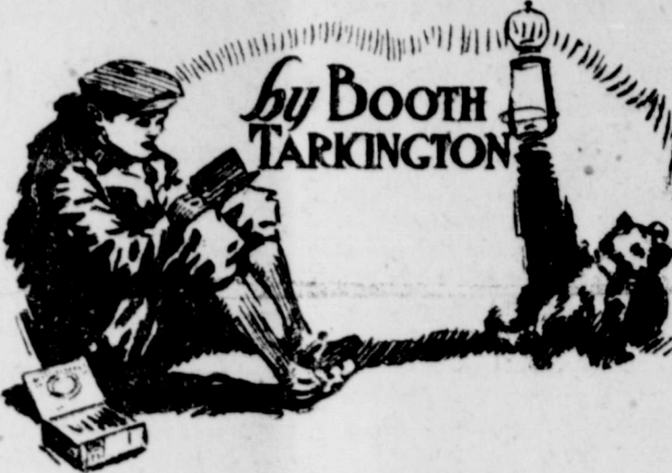
Copyright, 1914, by Doubleday, Page & Company