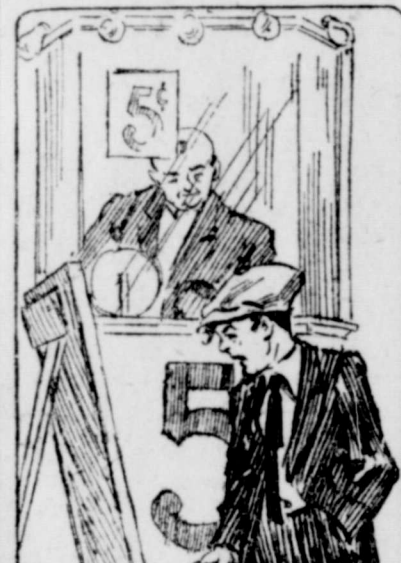
Equipped With This Collation Penrod Contributed His Remaining Nickel to a Picture Show.

Equipped with this collation Penrod contributed his remaining nickel to a picture show, contented upon the seventh day by the legal but not the moral authorities. Here, in cozy darkness, he placidly insulted his liver with jawbreaker upon jawbreaker from the paper sack and in a surfeit of content watched the silent actors on the screen.