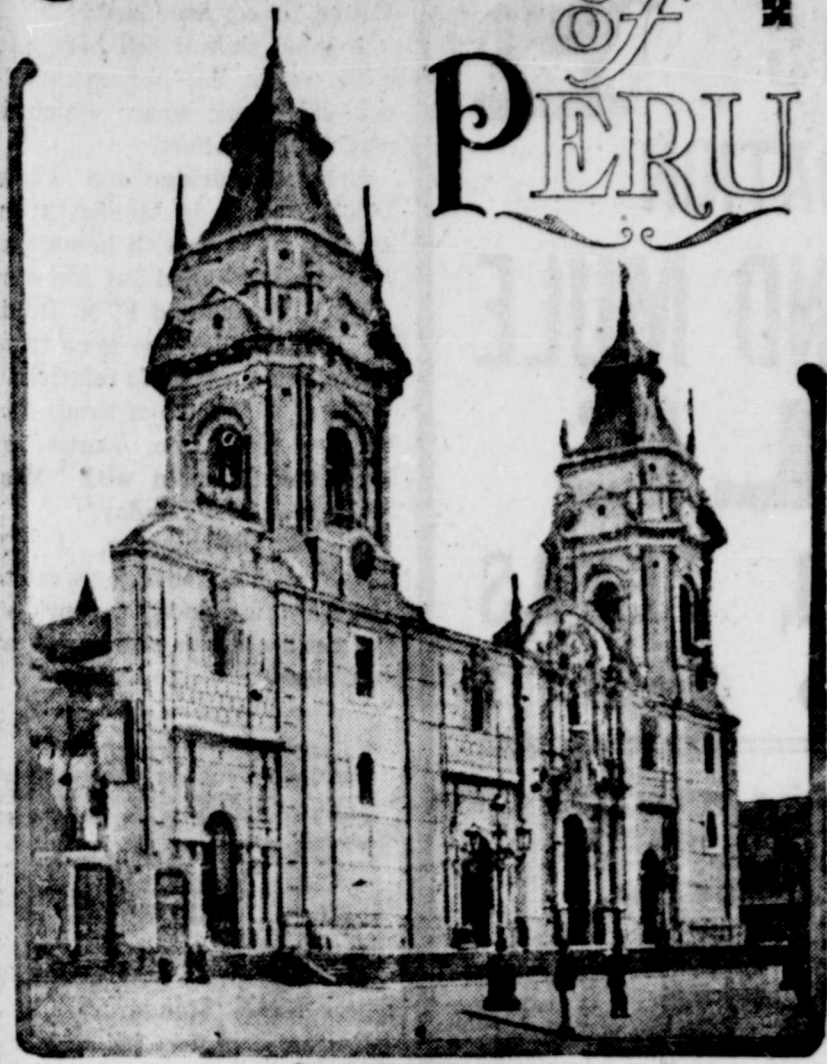
CATHEDRAL OF LIMA

THE traveler in South America who studies the various features of the history of that continent, the life of colonial times and that which followed it as the national life of the separate countries, soon discovers that there is a well-defined line of demarcation between that time when the people borrowed their artistic inspiration from the traditional sources in Europe and that later time when local influences began to be felt and when the continent developed its own artistic sense that demanded some original expression. This statement applies to the industries that were first brought over from Europe across the Atlantic; it is true of the social life and of education in all the republics of the southern continent manifesting characteristics which are peculiarly their own; it is likewise true of municipal and governmental affairs and finally in regard to the construction of their buildings, especially of the architecture ecclesiastical edifices of the diocesan capitals, says the French edition of the Bulletin of the Pan-American union. As an example of the colonial epoch in church architecture the cathedral of Lima offers a good illustration. That country has one archbishopric, that of Lima, eight dependent bishoprics, viz., Arequipa, Huancayo, Chachapoyas, Ayacucho, Puno, Trujillo, Cuzco, and Huaraz.