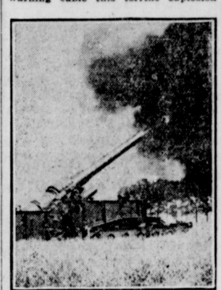
We Rushed Out and Found That One of the Guns Had Just Been Fired.

that lifted me off the table and dumped me halfway across the room. The whole place rocked, and every window in the house was broken. We rushed out to see what had happened and found that one of these guns had just been fired. I mention this merely to show what damage the concussion alone will do.