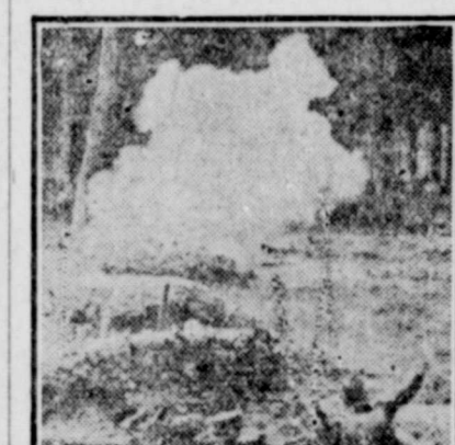
The Irishman Yelled, "Split that be

road to try and find him. He had come to earth safely, but his engine had been put out of commission by a piece of shrapnel. He had set fire to the machine and was calmly sitting on the ground some distance from where it was burning. Some flying corps fellows were there