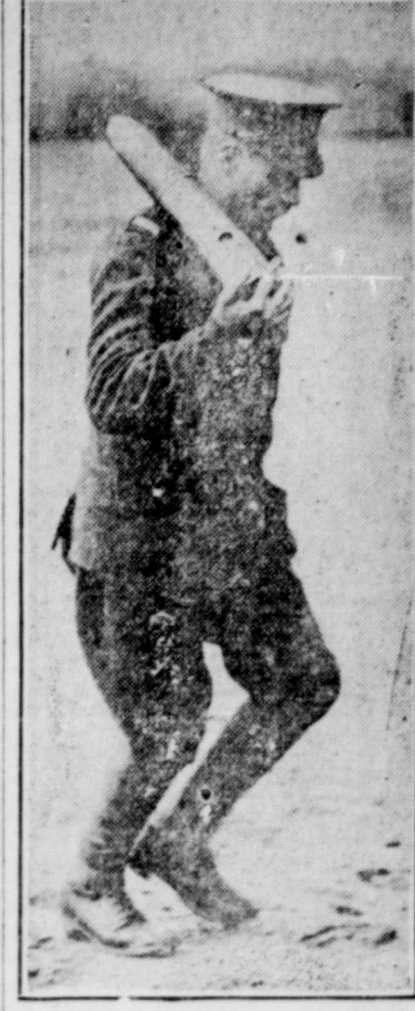
He Picked It Up and Came Dashing Into Camp With It.

course, it doesn't explode in your names before you have time to carry out this order. Corporal, fall in two men and see that this man obeys the order."