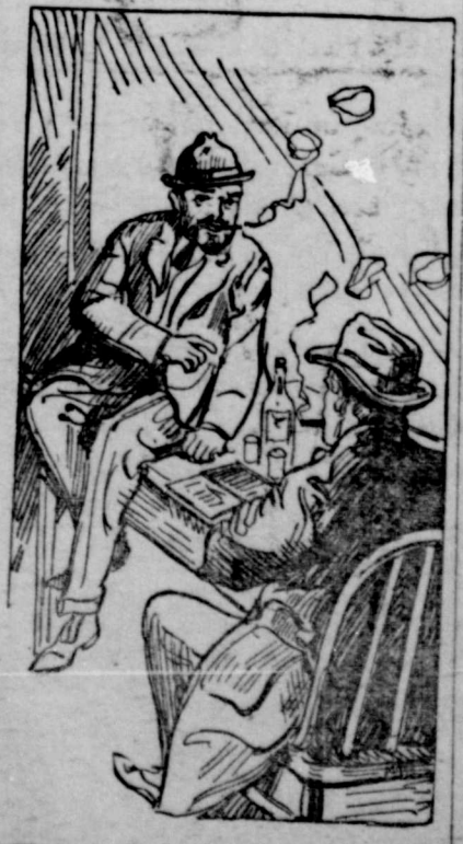
Knot or Two Yet to Be Untled.

"Well," he said finally, "everything is going according to Hoyle, but there you beat it?"