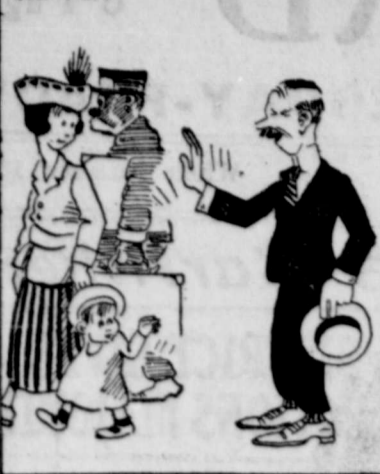
YOU BID THE WIFE AND KIDNIE GOODBYE AS THE LEAVE FOR A VACATION