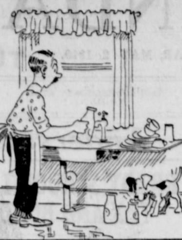
YOU WASH UP YOUR OWN DISHES THAT EVENING