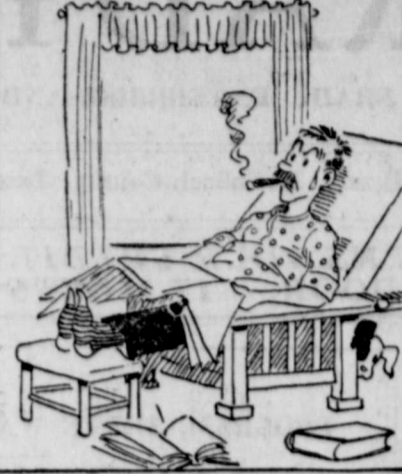
YOU GET LONELY AND TRY TO AMUSE YOURSELF BY READING THE LATEST DIVORCE SCANDALS