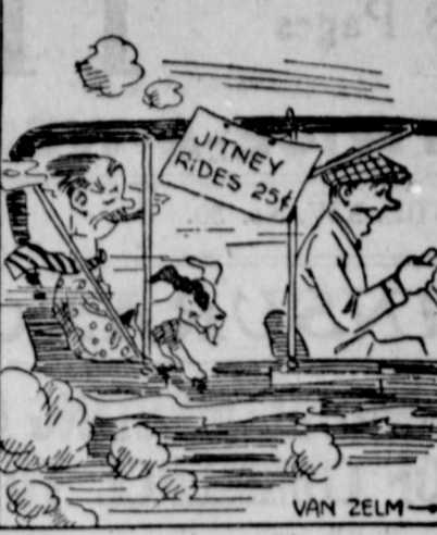
AW-WHAT'S THE USE!