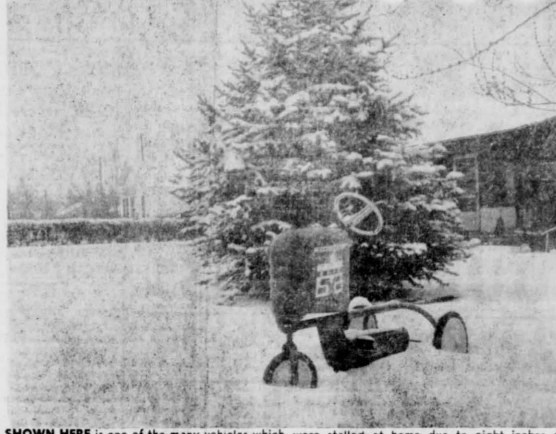
SHOWN HERE is one of the many vehicles which were stalled at home due to eight inches of snowy weather, Thursday. Owner of this vehicle preferred the nice warm fire to this white blanket of coldness. Just a few more inches would bury the wheels. The yard was much safer than those slick icy streets.